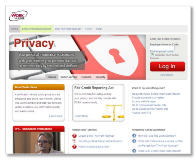
For more information, visit www.theworknumber.com/employees

Note: In some instances, you might be asked to provide a Salary Key prior to verifying your income information. A Salary Key is a unique six-digit number that allows one-time access to your income data. In most cases you will have granted consent when signing an application and a Salary Key won't be needed, but if asked to provide a Salary Key, you'll find instructions at: www.theworknumber.com or 800.367.2884.